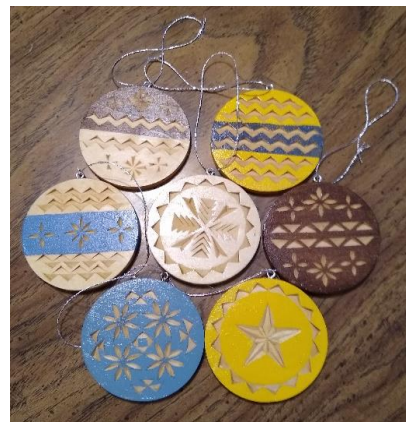
New round Christmas ornament patterns