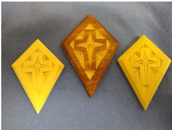
New cross pattern started from Char's necklace pattern