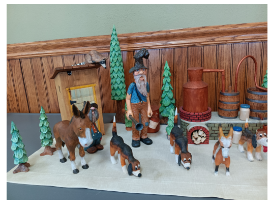
Right Side with Hounds