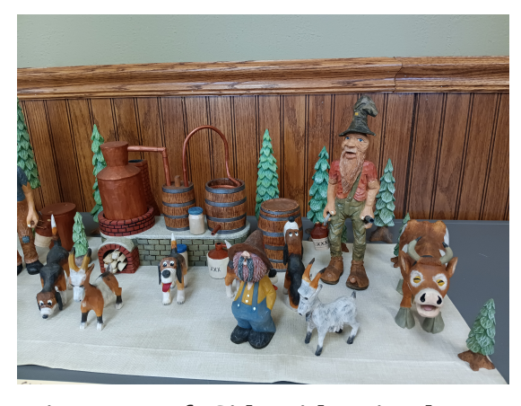
Diorama Left Side with animals

Of course, no good bootlegging scene is complete without a pack of loyal hound dogs. Ears perked and