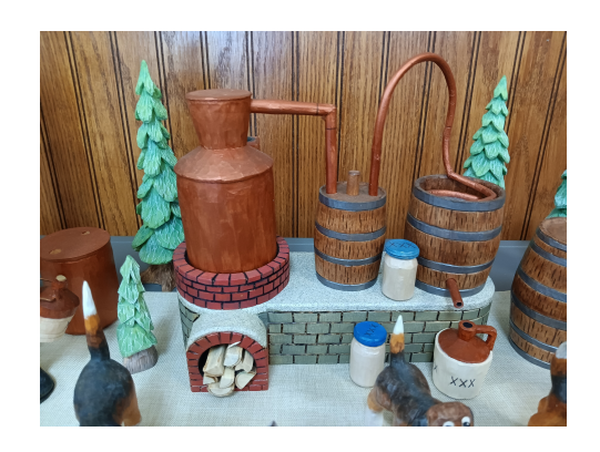
So, if you ever wondered what life was like before fancy breweries and distilleries took over, swing by and take a gander at this masterpiece. Just don't go sniffin' too close—you might catch a whiff of somethin' stronger than pine sap!