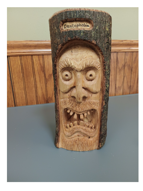
Working with Chainsaw